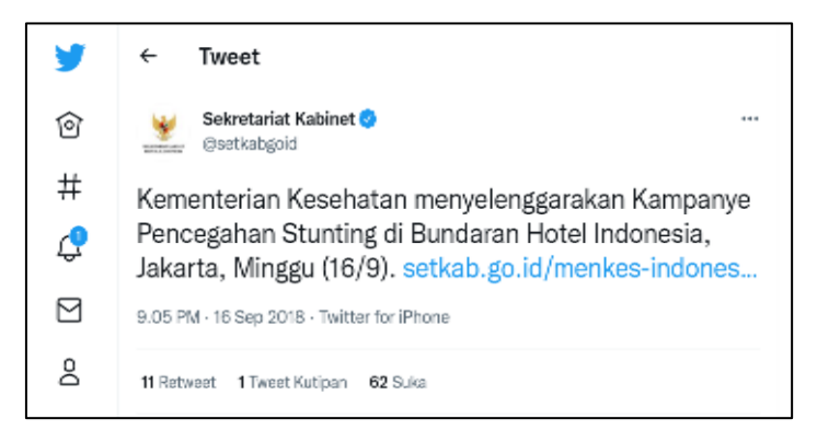
Figure 5. The Cabinet Secretary's campaign

Ministry of Health will hold a Stunting Prevention Campaign in Bundaran Hotel Indonesia, Jakarta, on Sunday (16/9)".