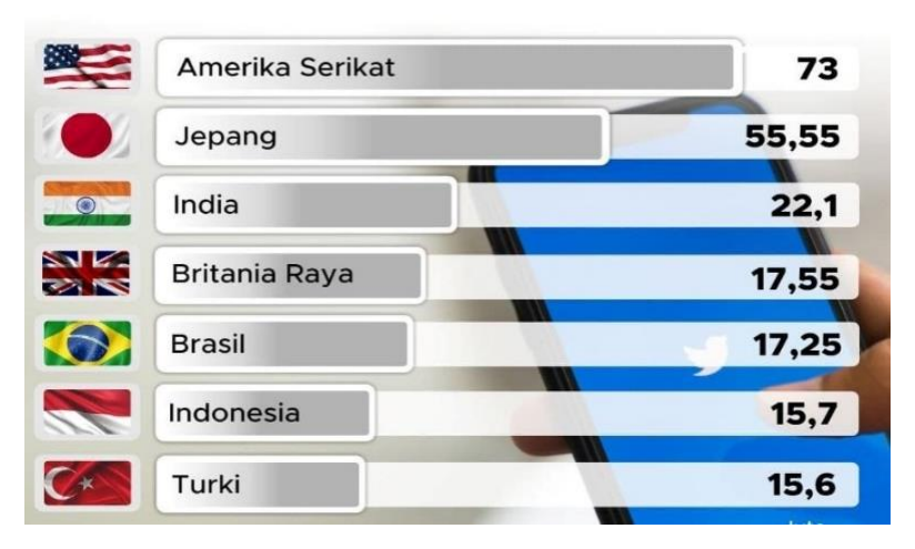
Figure 2. Indonesia held the sixth position in the world for Twitter's users (Ramadhanty, 2022)

Maclean et al (2013) stated that after Twitter's user makes an account, several texts including images and videos, or 'tweets', can be swiftly spread to anyone who is following the account. As a communication tool, Twitter enables the free exchange of ideas between people interested in certain interests, as well as providing the opportunity to engage in critical debate.