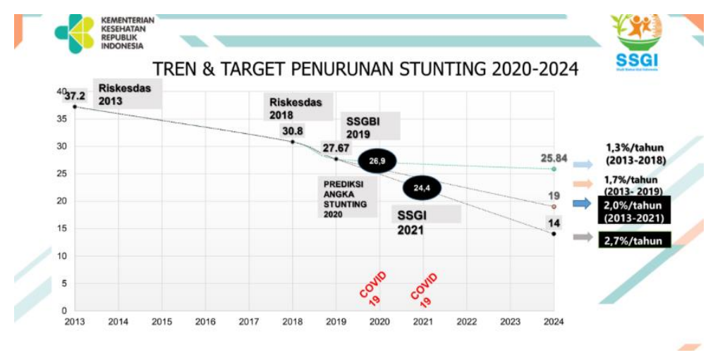
Figure 1. Stunting eradication targets (Ministry of Health, 2021)