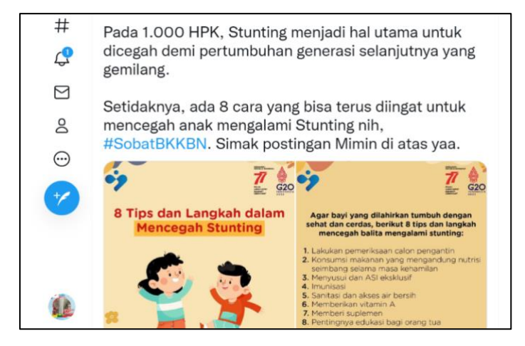
Figure 4. BKKBN's campaign (Twitter, 2022)

On July 26<sup>th</sup> 2022, the National Population and Family Planning Institution (BKKBN) through its Twitter account @BKKBNofficial implemented a persuasive communication pattern. This action was done at 2 o'clock in the morning, tweeted "On the 1000 First Day of Life (HPK), stunting becomes the main thing to prevent so future generations will have excellent growth. At least, there are 8 ways that can be remembered to prevent children suffering from stunting, #BKKBNFriends! Let's check the posts above".